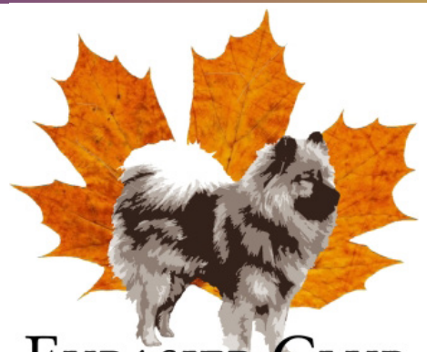
EURASIER CLUB OF CANADA