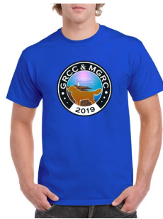
T- Shirt $10.00 each (sizes & colors the same as polo shirts)