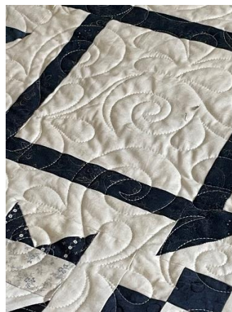
Quilting design close-up: "Wave on Wave"