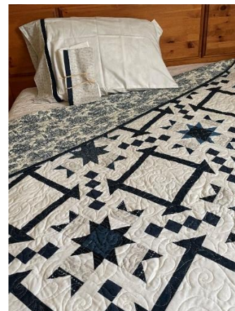
Quilting set: front, back, matching pillow cases