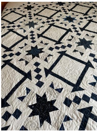
Piecing design: "Dashing through the Snow"

All-seasons quilt, Queen-size 94 x 94 inches High-quality, durable cotton fabric and machine-washable Retail value $1,000+