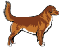
NOVA SCOTIA DUCK TOLLING RETRIEVER CLUB OF CANADA EST. 1974